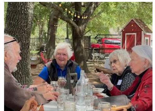
Attendees – April AIP-TW Social

The Wheel Kitchen - Tel. 346-336-8098 25510 Zion Lutheran Cemetery Rd, Tomball, TX 77375